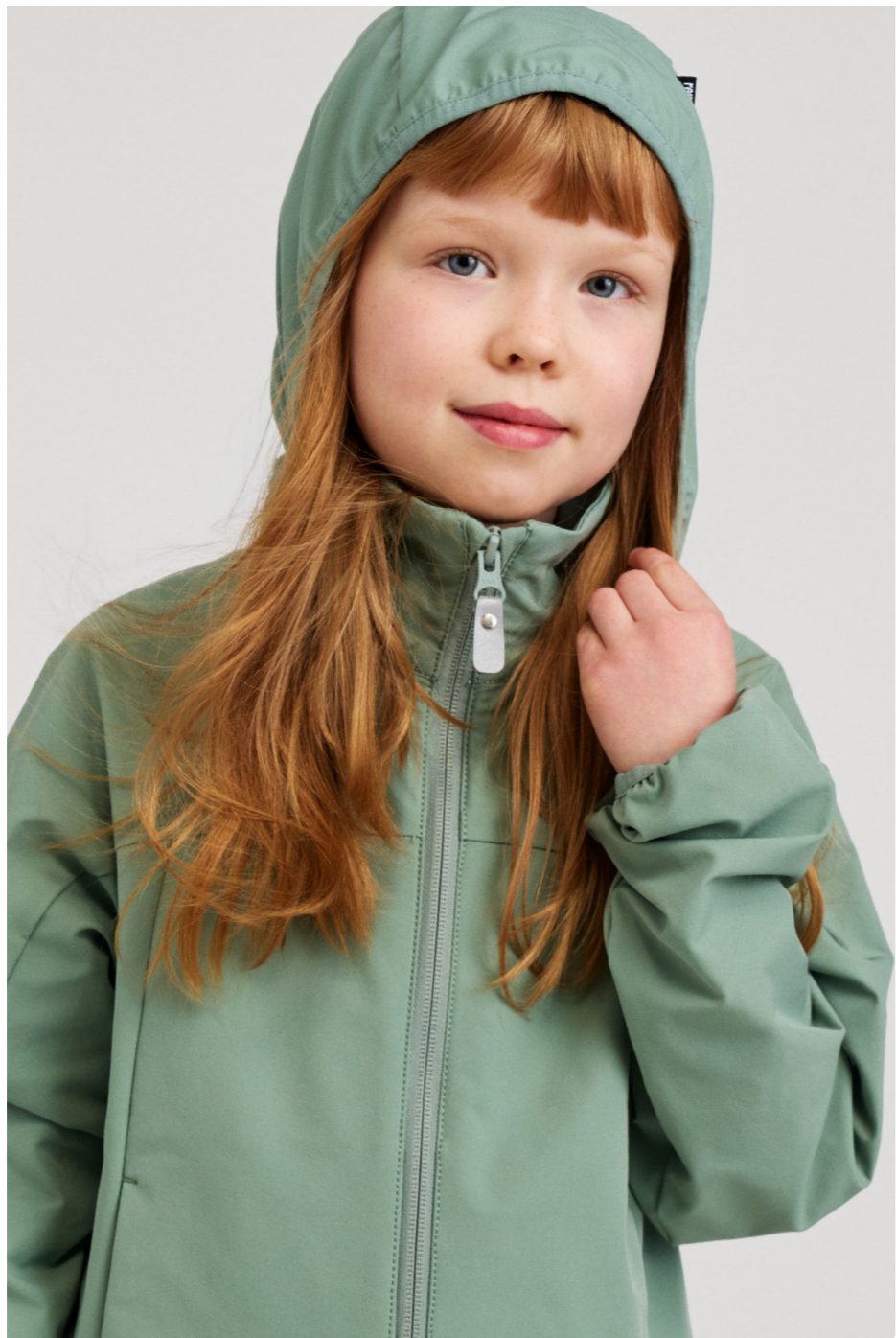
5100376G PURUTON JACKET