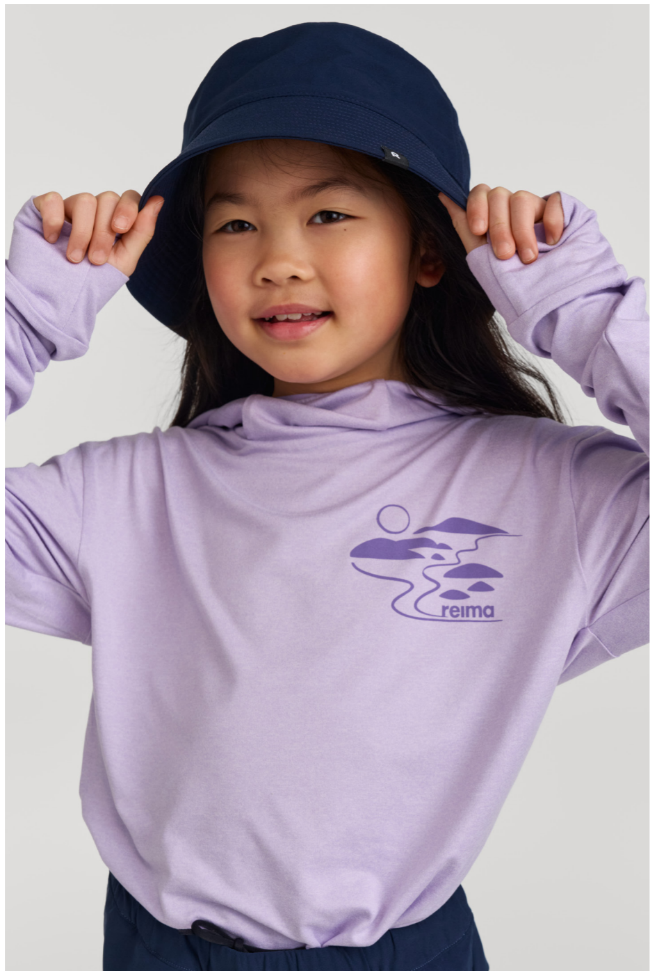
5300163G ITIKKA HAT, 5200409G SURISTA HOODIE