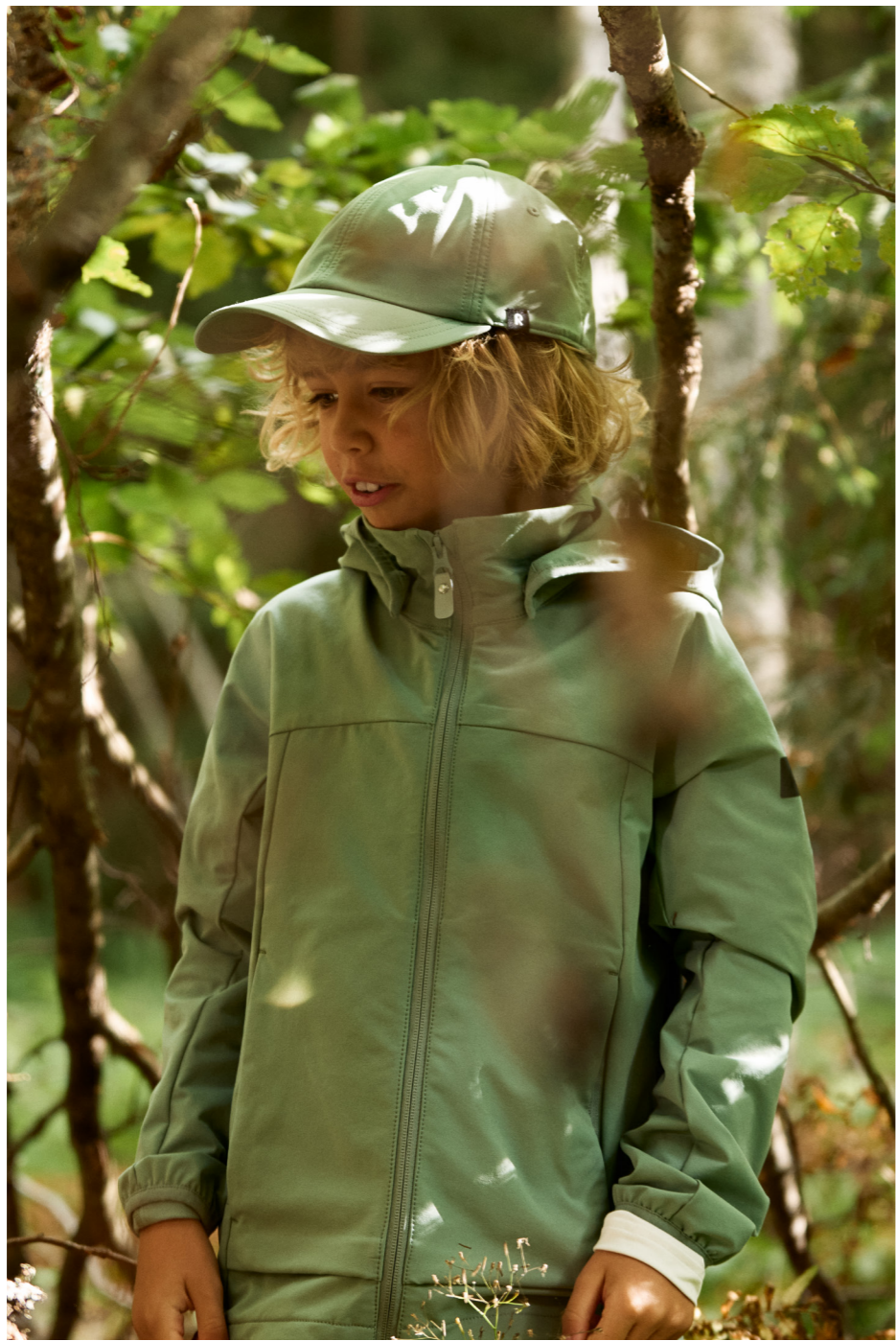
5100376G PURUTON JACKET