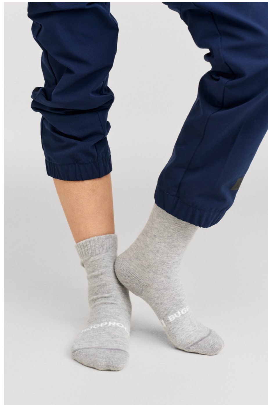
5300164G INSECT SOCKS

Reima BugProof clothing helps keep insects at bay, so kids can enjoy the outdoors more comfortably. For the best protection, it's important to cover exposed skin: use socks pulled over leg ends, pull up hoods, and tuck the shirt into the pants to keep little explorers fully covered and ready for adventure.