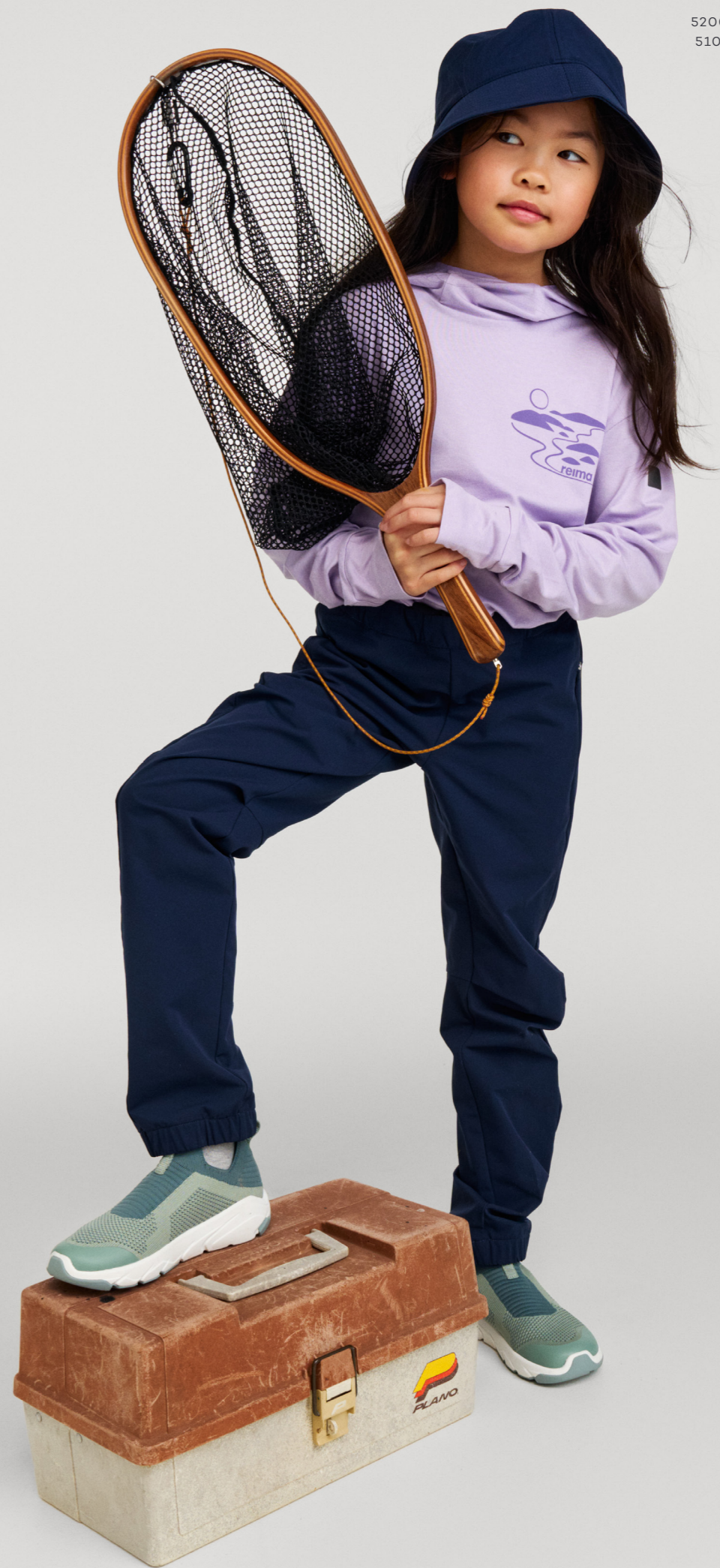
5300163G ITIKKA HAT, 5200409G SURISTA HOODIE, 5100378G PUNKITON PANTS